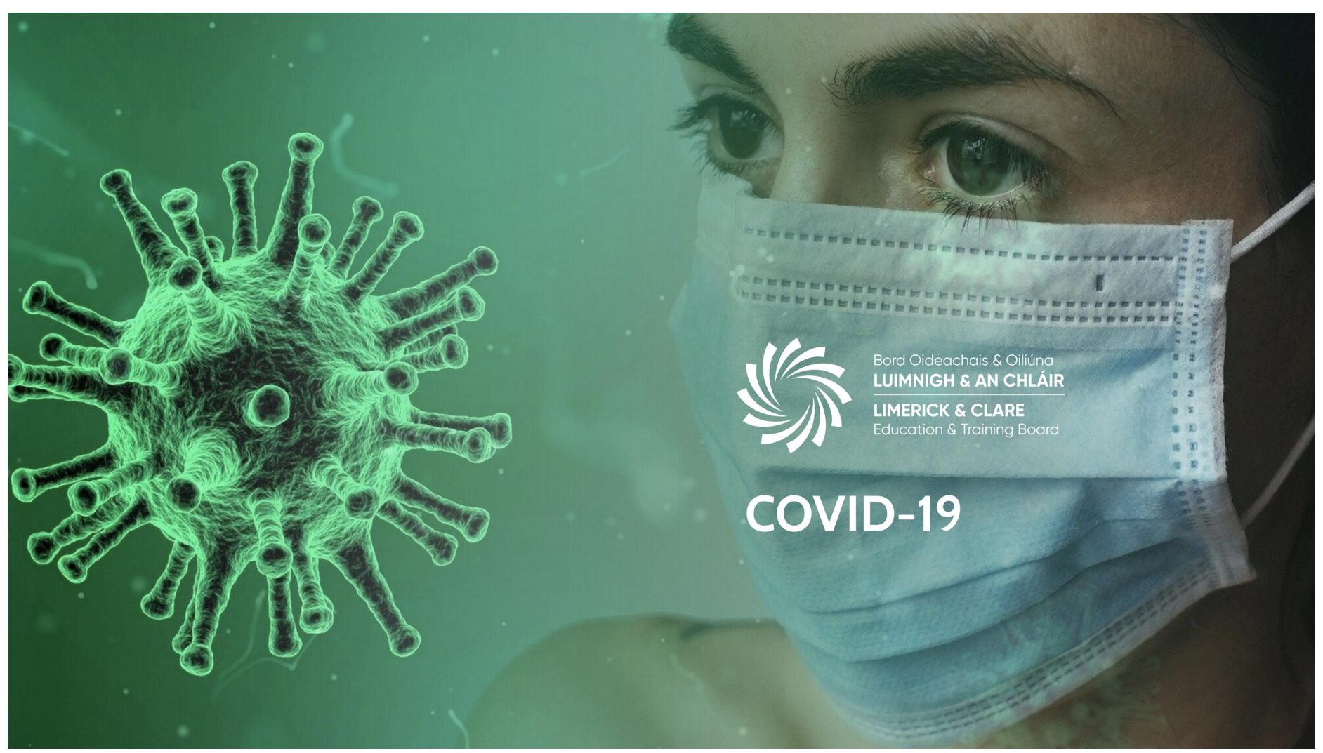
COVID-19 Response Plan for the safe and sustainable reopening of SCARIFF COMMUNITY COLLEGE