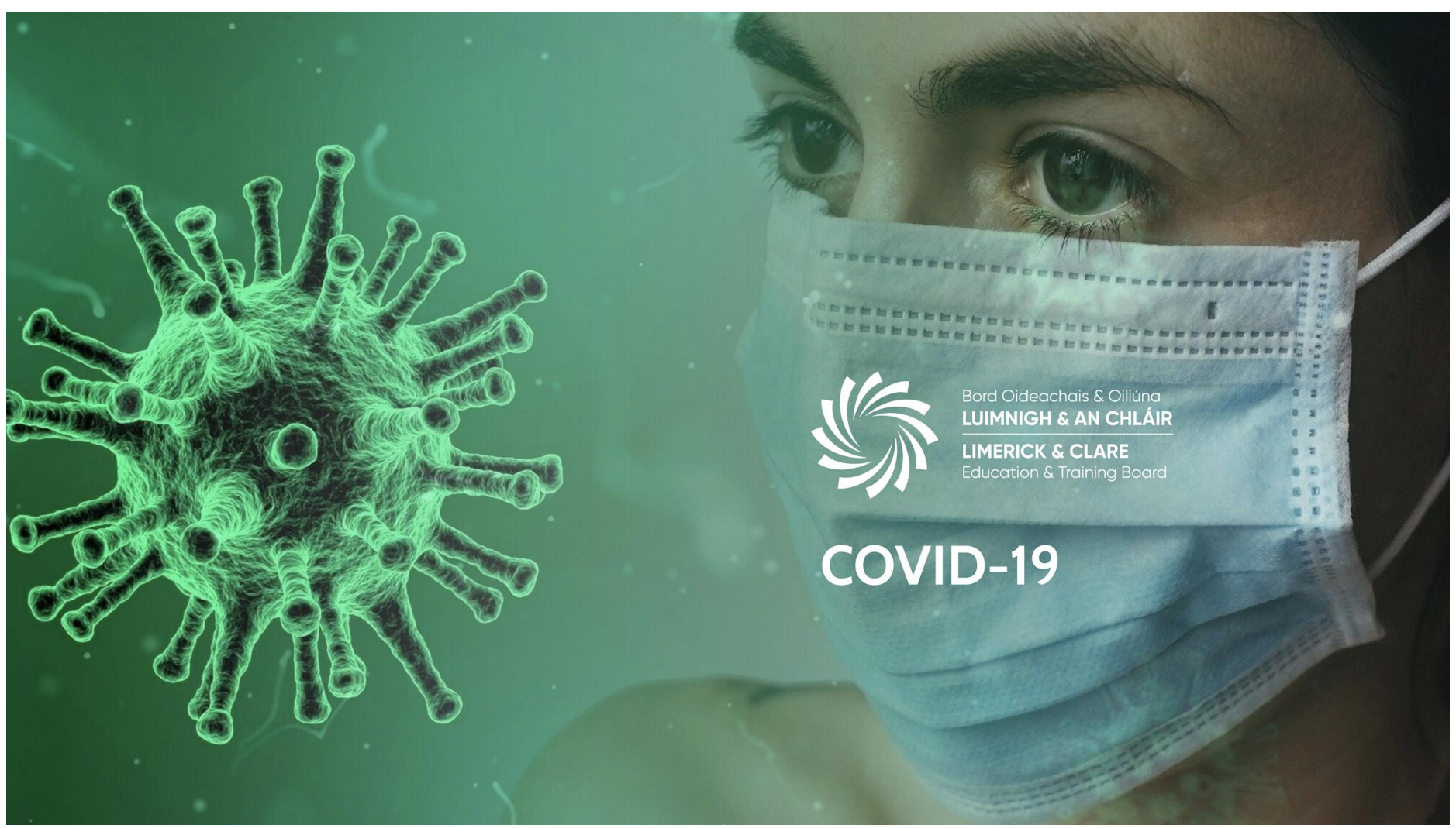
COVID-19 Response Plan for the safe and sustainable reopening of SCARIFF COMMUNITY COLLEGE